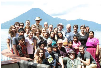
Xela AID Volunteers and local friends at Lake Atitlan, summer 2011.

* June 2-June 14, 2012 * July 29-August 9, 2012 20TH ANNIVERSARY VOLUNTEER VACATIONS